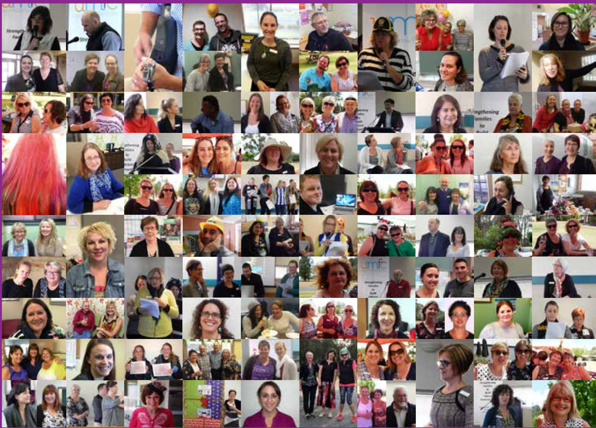
The Spirit of UMFC